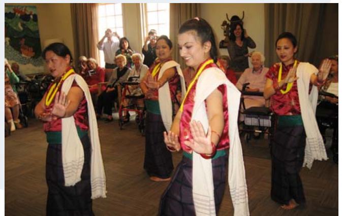
Residents watch the staff perform a traditional Nepalese dance at Nepalese Day